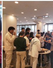
送別会 Farewell Party