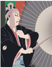
歌舞伎鑑賞 Kabuki Performance