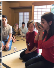
浅草ツアー / 茶道体験 Day Trip to Asakusa / Tea Ceremony