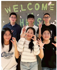
歓迎会 Welcome Party