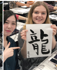
書道教室 Japanese Calligraphy