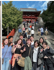
鎌倉ツアー Day Trip to Kamakura